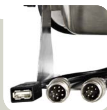
RS232 output and USB