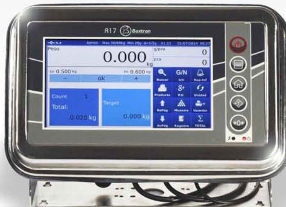
R17 Piece counting indicator