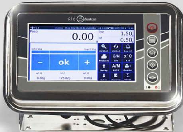
R16 Checkweigher indicator