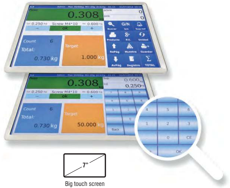
7" Big touch screen