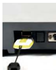
RS232 output and USB