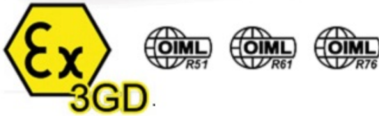
DGT603GD: weight indicator / repeater for ATEX zones