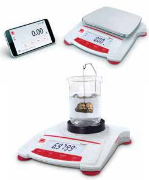
Scout shown with optional Density Determination Kit